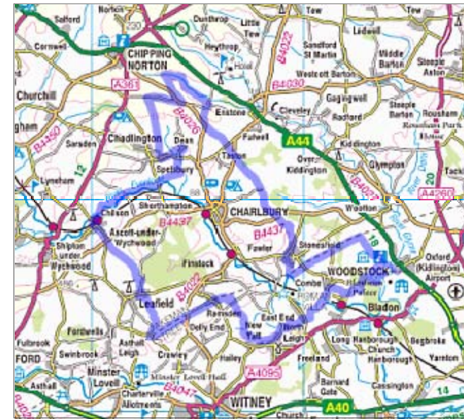
The Wychwood Way

2 miles north of North Leigh; 10 miles west of Oxford, off the A4095.